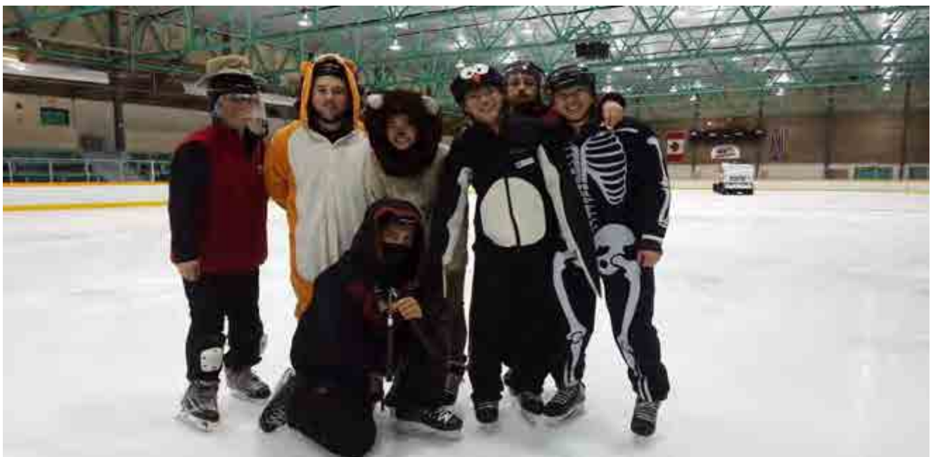
Sunset's Saturday Lessons staff dressed up for Halloween