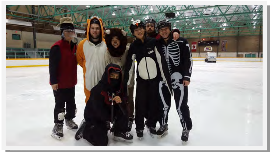
Sunset's Saturday Lessons staff dressed up for Halloween