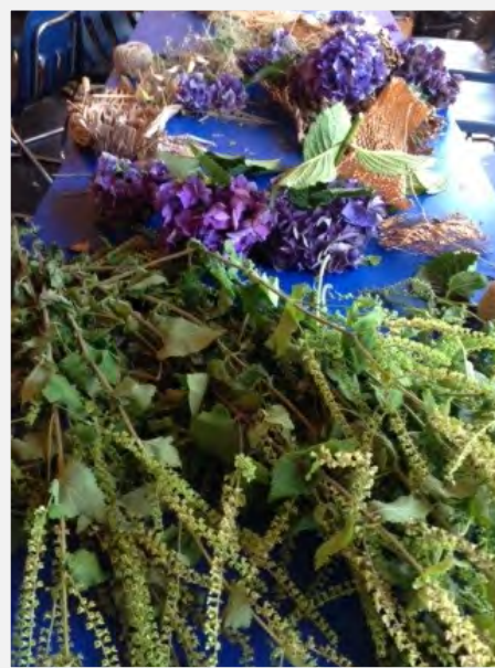
Nature Weaving & Papermaking