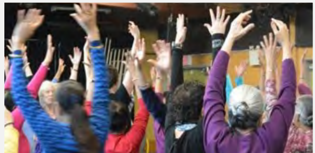
Daily Tai Chi @ MACC & Seniors Multicultural Dance (Arts Health & Seniors Project.)