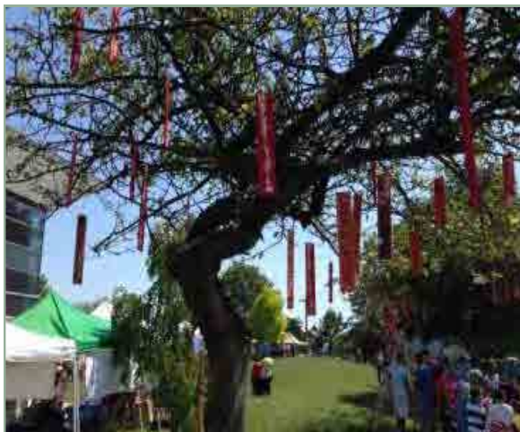
Reconciliation Art Project. Melanie Schambach. Canada Day

⇒ Outcome: Programmer Marina Ribatto continues to work on increasing preschool & children's arts program participation at SCC