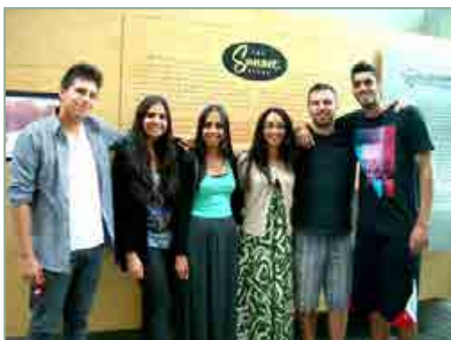
Summer Escape and Sports Camp staff (left). Ross Park youth gardeners (right).