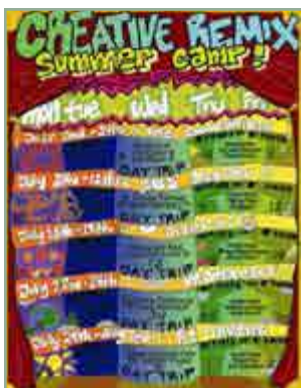
Creative Remix. 5 week summer camp full each week. Partnership with South Asian Family Assn.