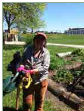
Neighbourhood Matching Fund to create new garden to be an educational and community food garden with native species