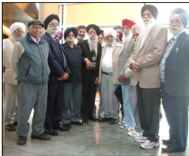
Fauja Singh, centre dressed in black, is a 101 year old marathon runner who was the oldest torch bearer at the London 2012 Olympics. Mr. Singh visited Sunset Community Centre's Thursday senior Indo-Canadian men's group on October 5th.